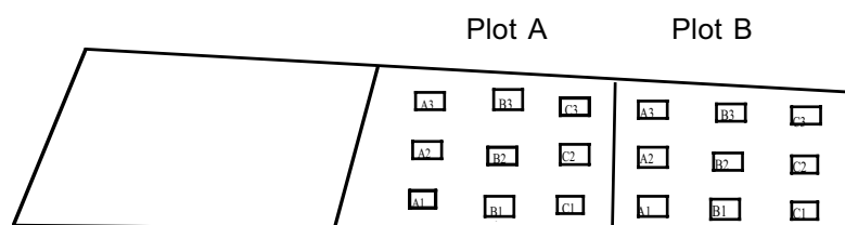
Fig. 1. Disposition of Ferula communis bunches in a ryegrass meadow divided into two plots A and B: each square represents a 350 g bunch of Ferula communis . Distance between bunches was approximately 10 m.