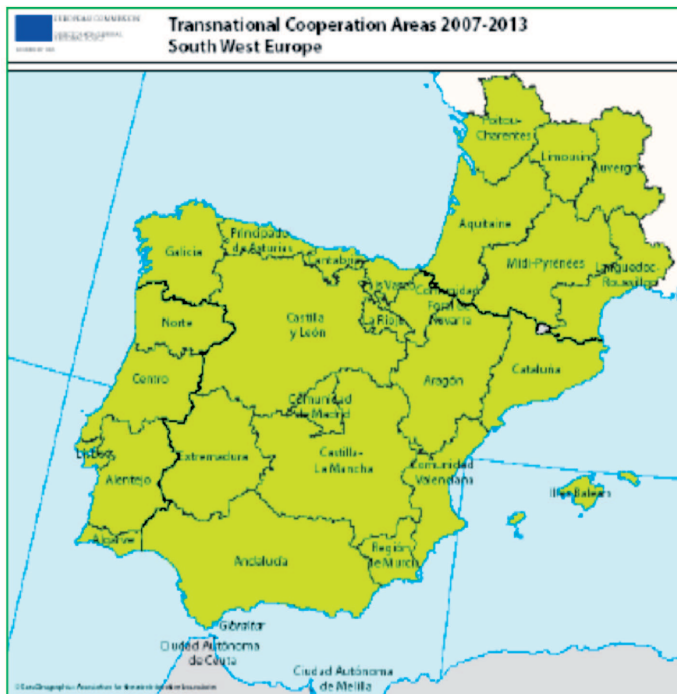
Fig. 1. The SUDOE Space.

The objective of the SUDOE Cooperation Programme is to consolidate the territorial cooperation of the Southwest European regions in the fields of competitiveness, innovation, environmental protection, and the sustainable planning and development of the area, contributing to the harmonious and balanced integration of the SUDOE regions and their social and economic cohesion within the European Union. The Southwest European Space (SUDOE), consists of 30 regions and autonomous cities (Fig. 1), covering 770,120 km 2 and populated by 61.3 millions inhabitants.