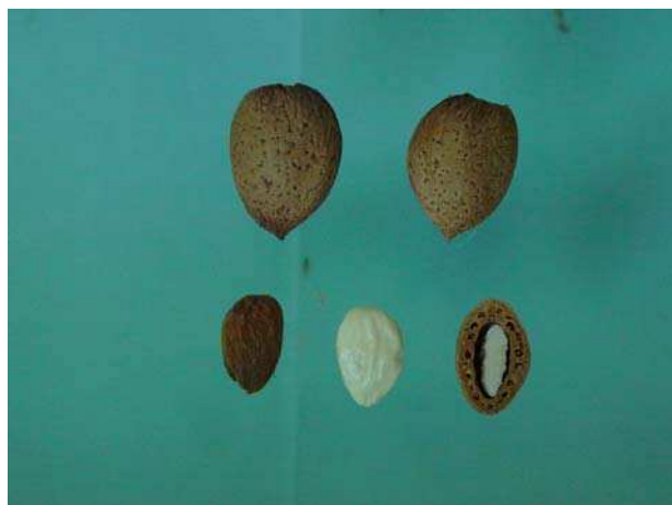
Fig. 2. Fruits of the new selection.

Nuts show a very good aspect and good size (4.9 g). Shell is hard (shelling percentage of 24%), adapted to the Spanish industry. Kernels also show a very good aspect and good size (1.2 g), heart-shaped, without double kernels (Fig. 2). Industrial cracking has been carried out by the Cooperative "Frutos Secos Alcañiz" and has shown very good results, without presence of double layers in the shell. Kernel breakage at cracking has been low, with 86.2% of whole kernels.