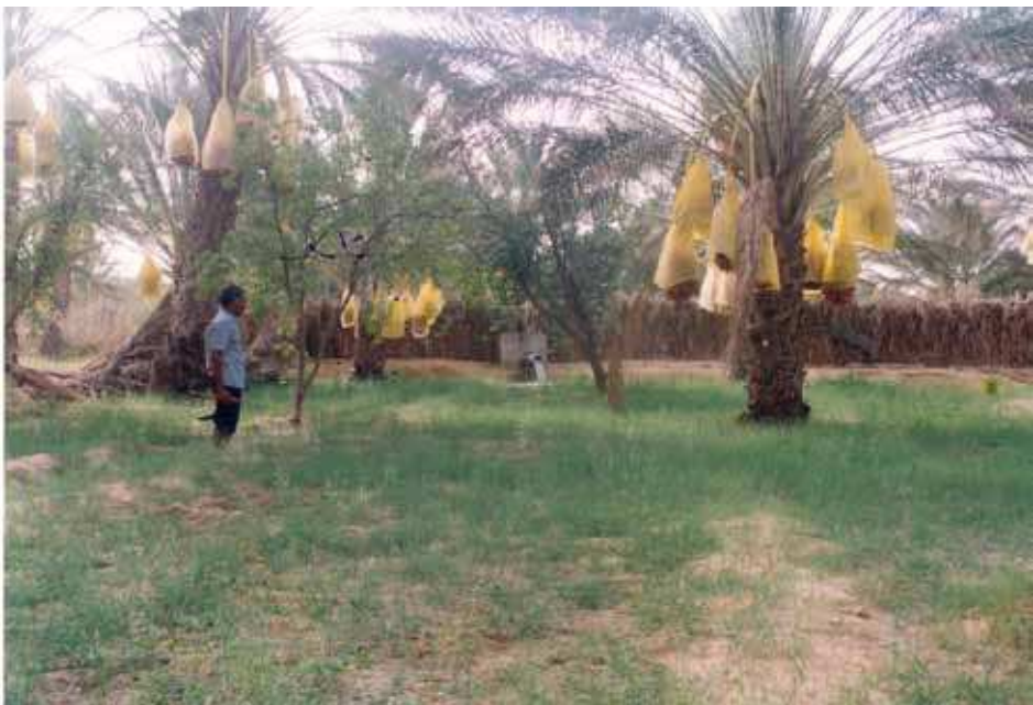
Figure 4. Traditional irrigation method inside a farmer's parcel in Kebili oasis.

The traditional irrigation method still widely used by farmers within the oasis (see Fig 4), this water over application leads to hamper water and brings out the shallow water table rise. Other consequences of such irrigation method could be an outflow between parcels. Risks of water logging become evident, particularly for parcels located downstream the oasis.