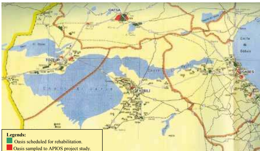
Figure 1. Localization of Southern Tunisia Oasis (adapted from SAPI, 2005).

Since the 1980s, within the framework of the Master Plan of Southern Water (PDES), the irrigation knew an important development. After the rehabilitation of the hydraulic infrastructures within the old traditional oases, the commitment of the authorities was focused on the enhancement of the irrigation efficiency. Several research works undertaken in these regions showed an alarming balance on the water management in the oases. Significant water losses were still occurring in the parcels where the competent authorities' efforts should be focused on farmers. This article is focused on the perspectives of irrigation efficiency improvement within parcels where the experience feedback often showed that, besides the technical aspects, the extension and awareness building on the water saving are a crucial tool that has to be certainly intensified.