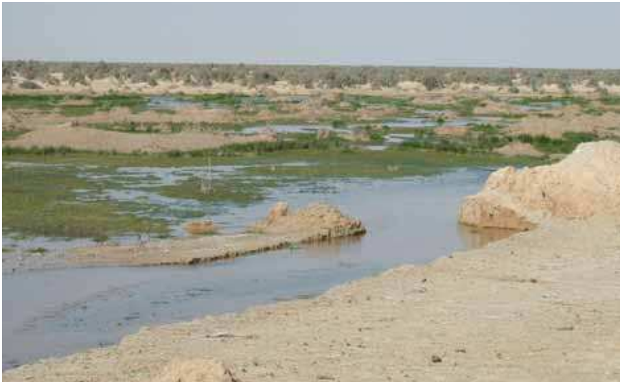
Figure 6. Accumulation of drainage water in the oasis depression.

The oasis extension is one of the most important current challenges to face within the next coming decades. The multiplication of private parcels occurs always at the oasis periphery. Their water consumption is very high, as twice as that of the public irrigated area. This induces important water wastage and significant drainage water amounts. The water surplus provides the shallow water table that rises up and leads to water logging phenomena, all the more so the private extensions are mostly located downstream and do not benefit from sufficient differences in level, which allows a far distant drainage water evacuation. Also, salinization risks become very imminent in such water management conditions (see Fig. 6).