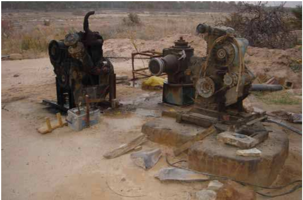
Figure 2. Illegal drilling supplying private oasis in Kebili.

Under intensive pumping and overexploitation, the continuous decrease in the piezometric level has led to the complete drying up of natural sources. Water became gradually more expensive due to the rise of pumping costs, and to the deterioration of water quality (i.e. water salinity from CT reached 6 g/l in Douz Eastern Kebili). Furthermore, the multiplication of illegal wells (see Fig 2) accentuated this phenomenon.