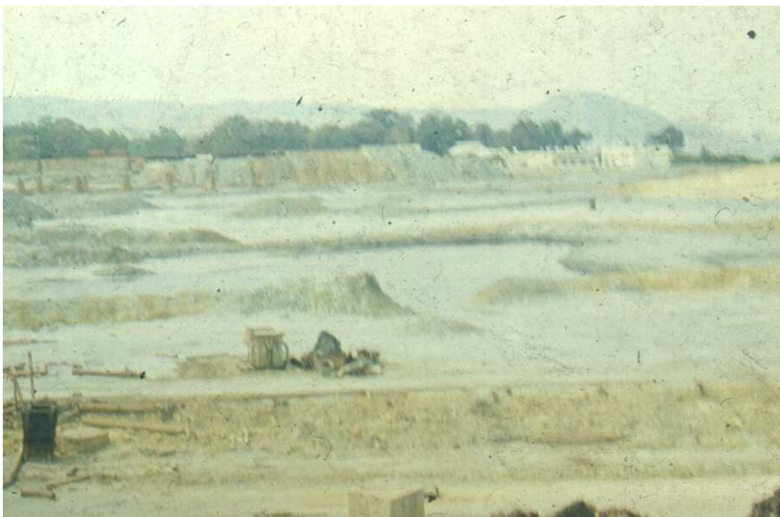
Fig. 4. The wastes of CMC in Mediterranean coastline