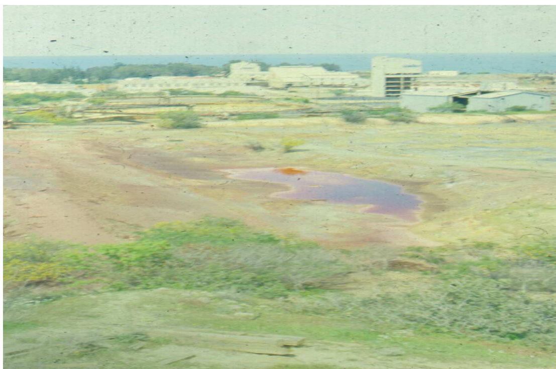
Figure 7. Reddish colour from iron, yellowish from sulphur due to mine wastes in CMC area

According to heavy elements concentration dispersal results maintained from the leaves of particular plants, boron is found as being most condense in the orange leaves and 31.1 ppm; magnesium in bean leaves and 0.66 ppm; iron in bean leaves and 175.0 ppm, manganese in cabbage leaves 141.0 ppm, zinc is bean leaves and 27.0 ppm, copper in bean leaves 24.2 ppm, molybdean at level of microamount in all samples, cobalt in cabbage leaves 4.95 ppm, chrome in orange leave 26.0 ppm, nickel in mandarin and bean leaves and 5.3 ppm are the identified data (Table 6).