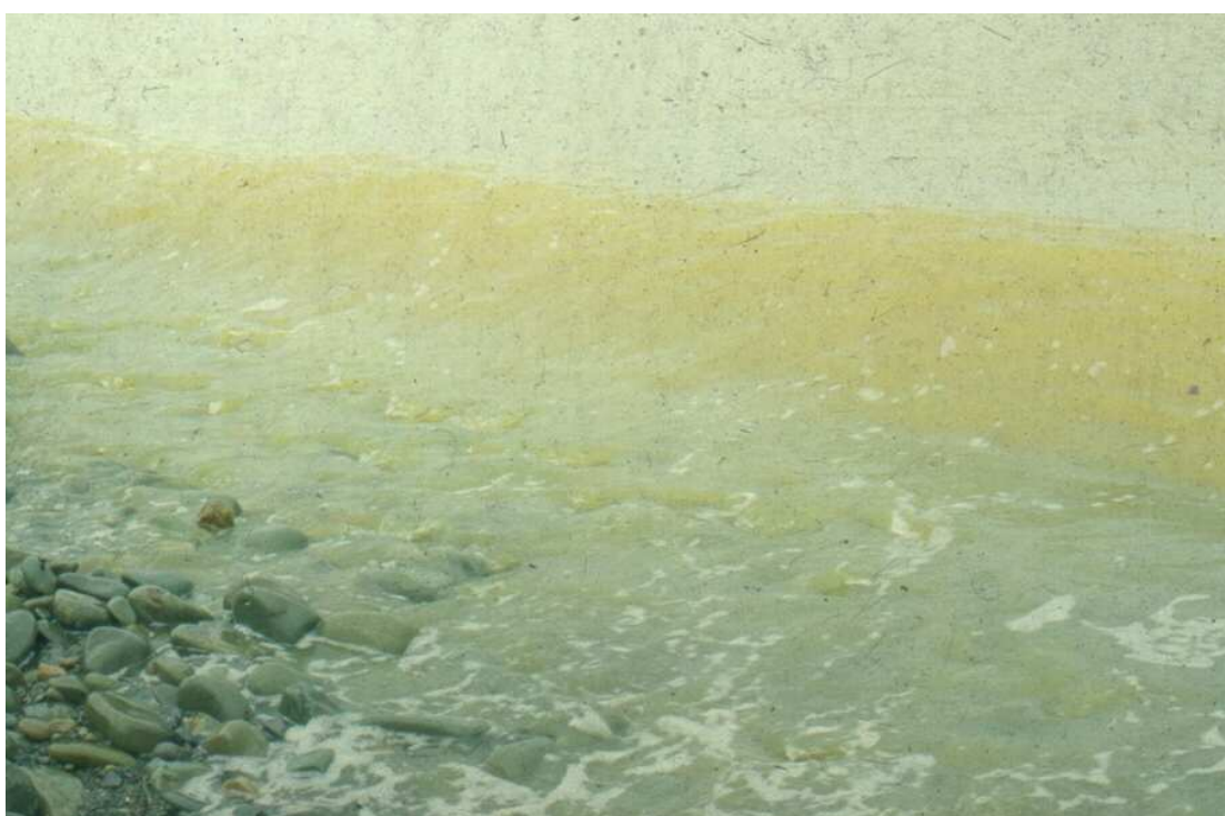
Fig. 5. Abnormal colour condensation in Mediterranean waters by the coastline

The source of the blue colour observed on the upper parts of Gemikonagi puddle and in direct connection points with Maden stream within the same puddle is the copper element. Gem wastes, chemical material wastes, solid wastes left after the gem plantation are observed from sea level to upper areas at Gemikonagi, increasing the environmental problem.