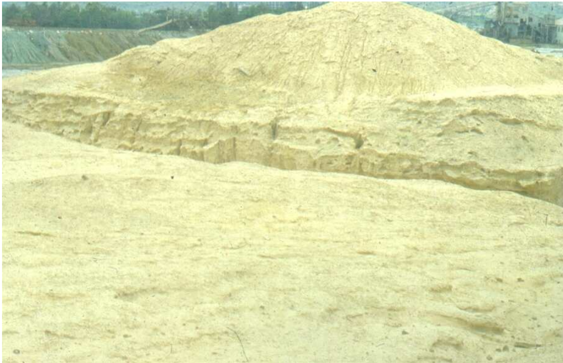
Fig 1. The little waste hill was developed by CMC