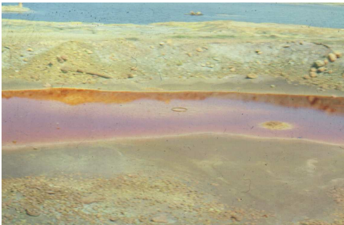
Fig. 6: Reddish colour from iron, yellowish from sulphur

that our skin is effected from this acidic condition very negatively. Beside all clay+silt particles spreading around up to 70-80 % extend by the help of surrounding winds in form of dust clouds create environmental pollution rich of heavy metals and sulphur.