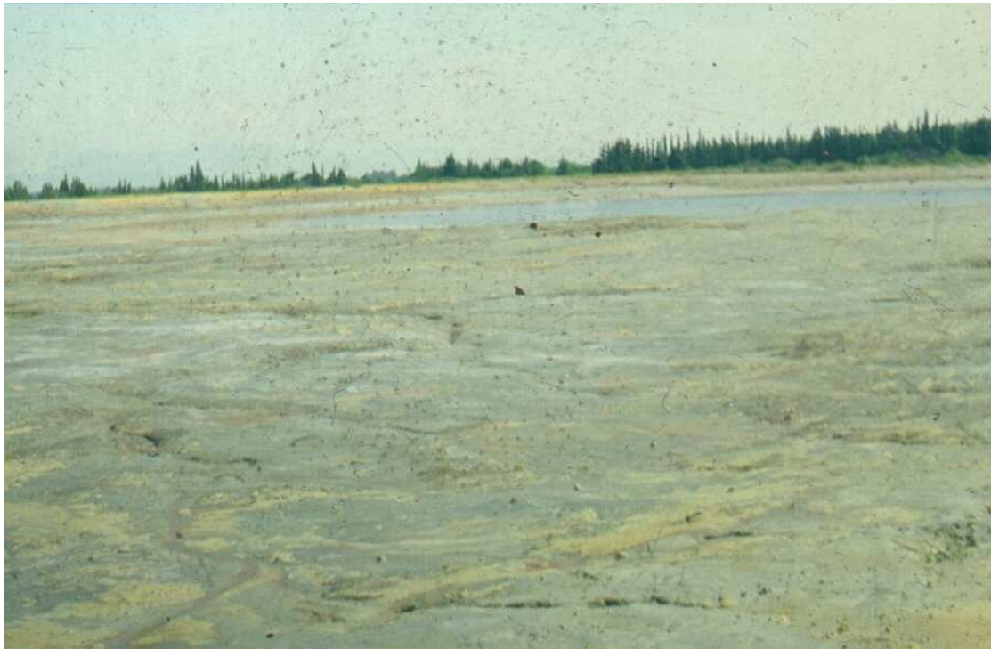
Fig.2. One of waste pools in CMC area