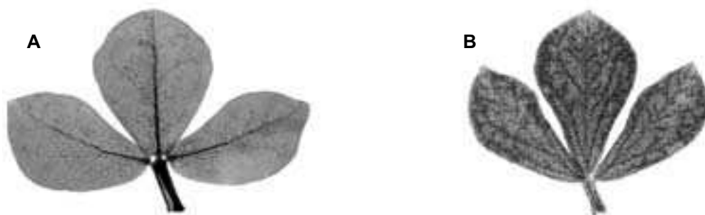
Fig. 1. Leaves of L. corniculatus lines stained for the presence of condensed tannins with DMACA: (A) untransformed control line, (B) Sn transgenic line Sn 11.

Sn is a member of the R family of myc regulatory genes from maize ( Zea mays ), where it regulates the cell specific deposition of anthocyanins in seedlings and adult cells (Tonelli et al. , 1991). Transgenic lines of L. corniculatus var. Leo isogenic genotype S50 transformed with the constitutively expressed Sn bol3 allele are altered in their accumulation of CT accumulation in root and foliar tissues (Damiani et al. , 1999). In many lines there is a marked increase in CT accumulation relative to control plants. This can be seen clearly in Fig. 1, which shows leaves from an up-regulated transgenic line and a control line in which the CT containing cells have been stained purple with DMACA (Li et al. , 1996). This effect of the transgene is specific to CT and anthocyanin biosynthesis and analysis of other key flavonoid end-products in leaf and stem samples shows no alteration in the levels of lignin and flavones (Fig. 2).