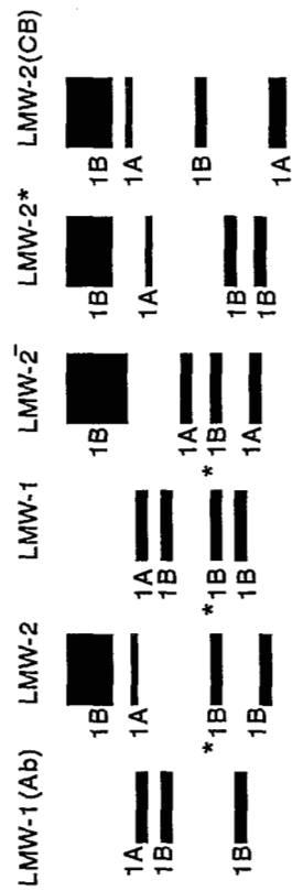
Fig. 2. Chromosome control of the B subunits of LMW glutenins patterns from different Spanish durum wheat landraces. * band coded by locus Gli-B3 (Ruiz and Carrillo, 1993).