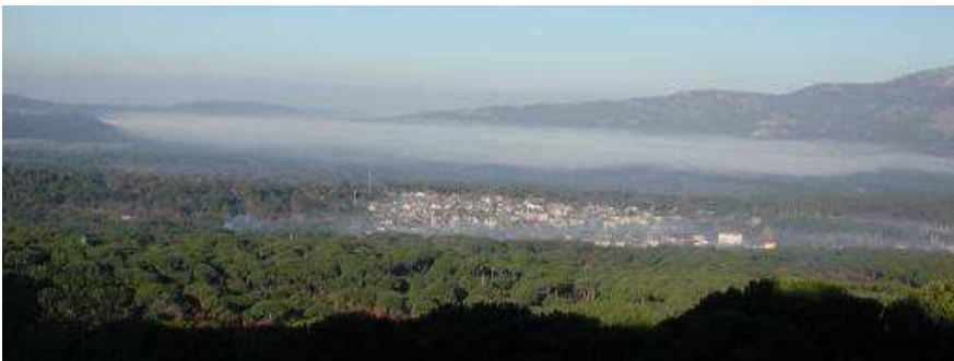
Fig. 1. Foggy Landscape of Upper Kozak Basin.

Historic climate records showed an average precipitation of 939 mm in the village Yukarıbey [500 m a.s.l., 1963-1998] and 741 mm at Güneşli Station [700 m a.s.l., 1980-1994]. Although both station are located in the same basin and the distance between them is less than 10 km, there is a precipitation difference of nearly 200 mm, though the altitude difference between both is 200 m. The reason might be the prevalent north winds that leave more precipitation at windward mountains slopes than at lee (Anonymous, 2010). Occasional fog occurs in the basin in winter and autumn (Fig. 1).