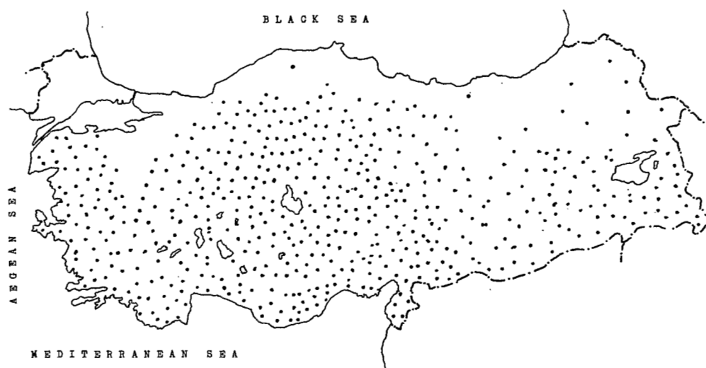
Fig. 1. Area sown of chickpea in Turkey, 1986. (Each dot represents 1000 ha).

Until recent years there were no registered chickpea varieties. In 1987, "Canitez 87" and "Easer 87" were registered by Eskisehir Agricultural Research Institute and Ankara University Agricultural Faculty respectively. Additionally, the cultivar ILC 195/2 was licensed for seed production. Variety "Canitez 87" is large-seeded type but highly susceptible to ascochyta blight. On the other hand, seeds of blight resistant line ILC 195/2 and tolerant variety Easer 87 are not large enough. In terms of seed